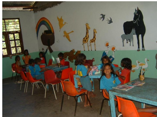
Condition of existing chairs and tables in FITUN ESPERANCA school Macadade