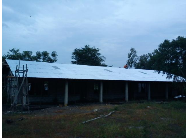
Pictures of new school building in Villa. Just finalizing the roofing, plastering and flooring is in progress